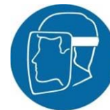
13 Face Shield