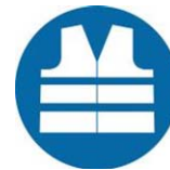
15 Hi-Vis Vest