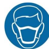
10 Dust Mask