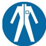
14 Protective Clothing