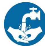
5 Wash Hands