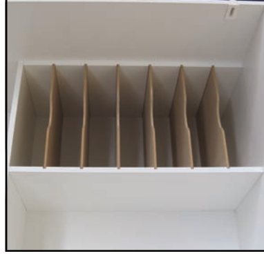
Versatile document shelves