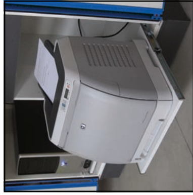
Pull-out printer shelf