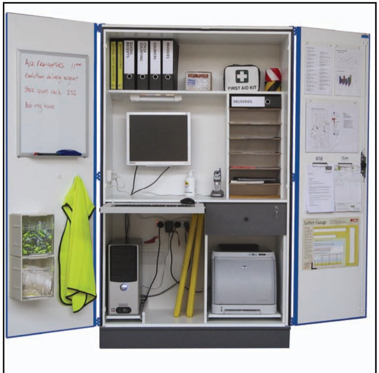
The Data Space TM Industrial Workstation is creating smarter workplaces TM . This one is set up for Goods Receipt / Despatch.