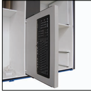
Recessed keyboard in worksurface