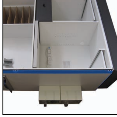
Doors fold back to give clear access